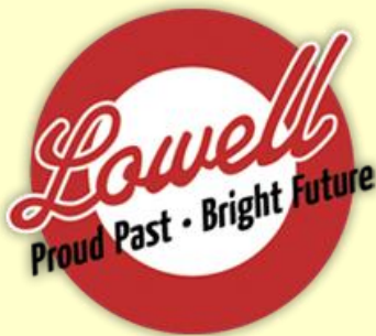
Lowell Town News

Fall Soccer – for youth 4 – 14 years of age Registration will be at the town hall June 27 th from 6 – 8 pm and June 28 th from 9 – 11 am